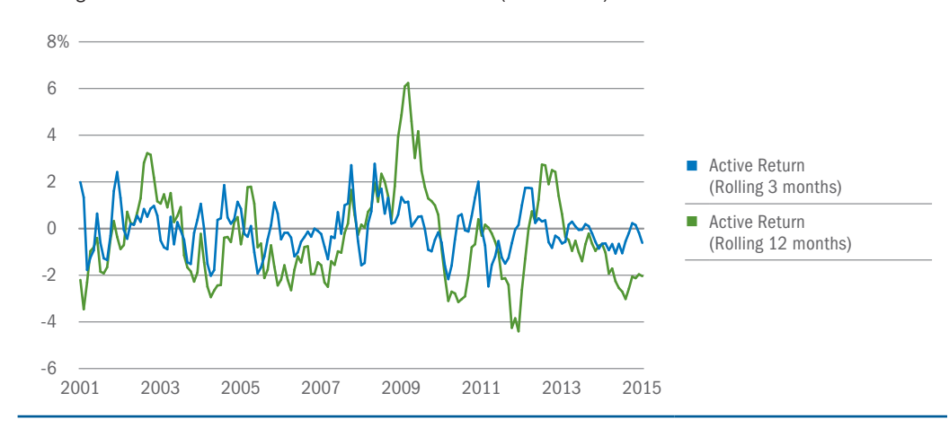
Exhibit 4: RI indexes subject to greater short-term performance variations

Rolling active return - MSCI USA IMI ESG vs. Russell 3000 (2001-2015)