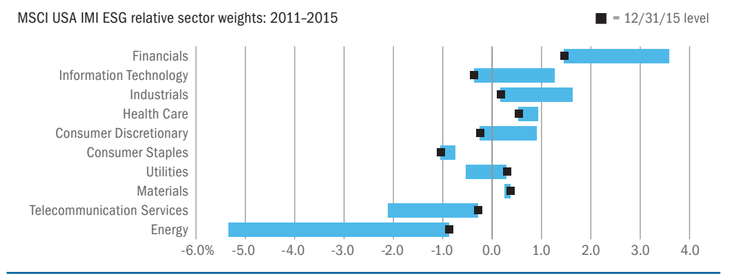
Exhibit 6: Sector weight deviations can change over time

As an example, Exhibit 6 shows sector over/under weights for the MSCI USA IMI ESG Index compared to MSCI's own broad market index over a five-year period and how these levels changed over time.